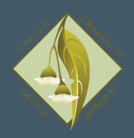
CaNSCC Dune & Bush Revegetation and Weeding Groups